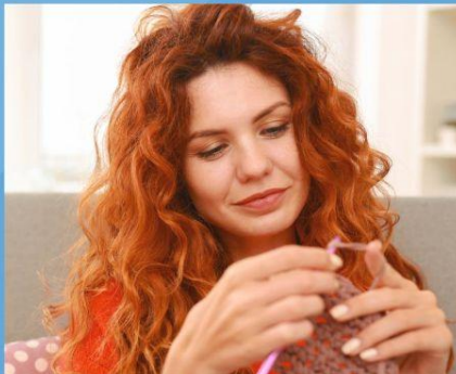
Library of Things